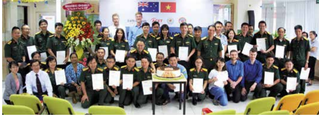
Members of the South Sudan-bound medical team display their IELTS certificates.

As part of being accepted by the UN, the hospital had to prove the English language proficiency of its staff, with the required level set at an International English Language Testing System (IELTS) band score of 5.5.